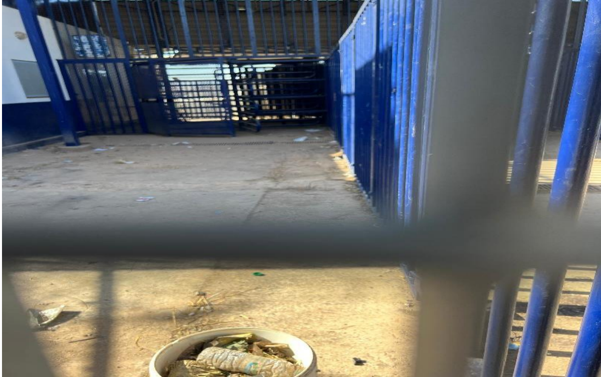
Picture 3: Hermetically closed unidirectional turnstiles where migrants were trapped.