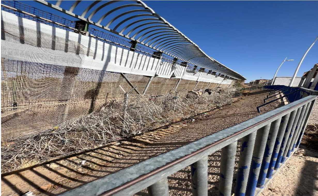
Picture6 : A ditch with barbed wire separates the crossing yard from the iron fence surrounding Melilla