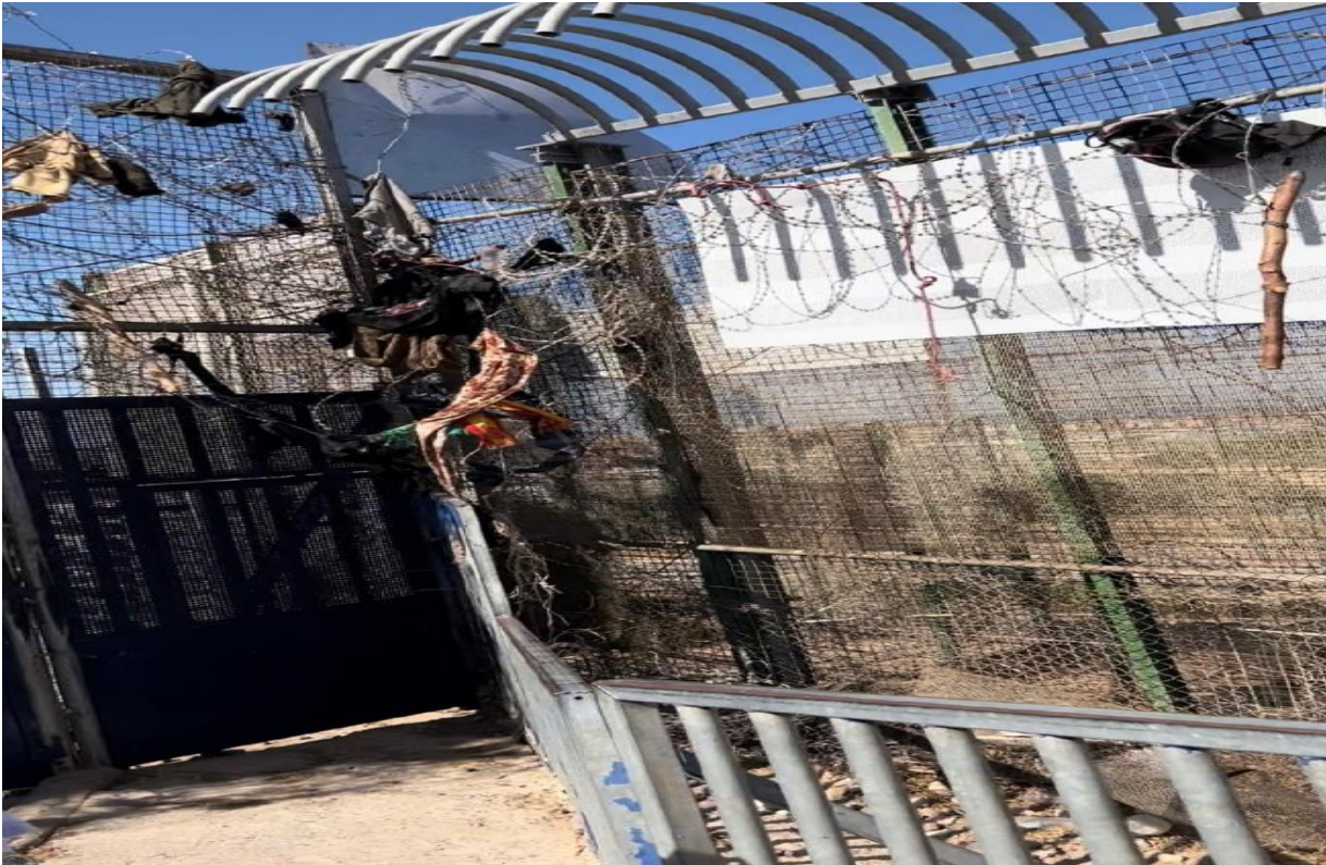
Picture 5 : Remnants of clothing, wooden sticks and backpacks stuck to the barbed wire over the doors and on the fence