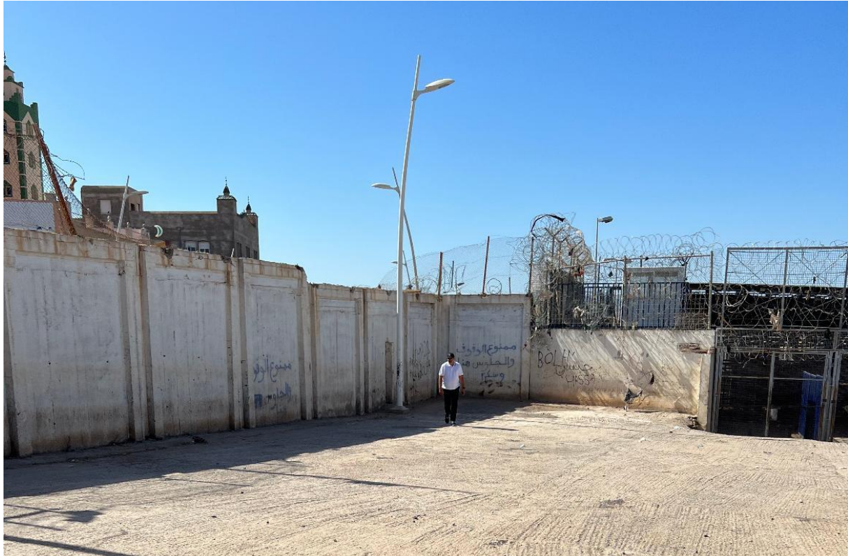
Picture 4 : The collapsed part of the fence that tops the walls of the crossing yard