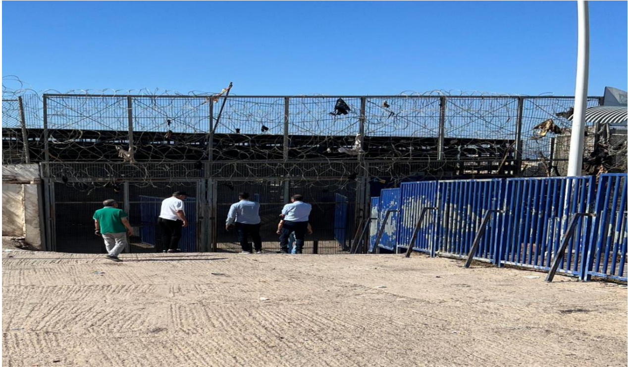
Picture 1: The gates of the buffer zone are topped with barbed wire that still carries some torn clothing