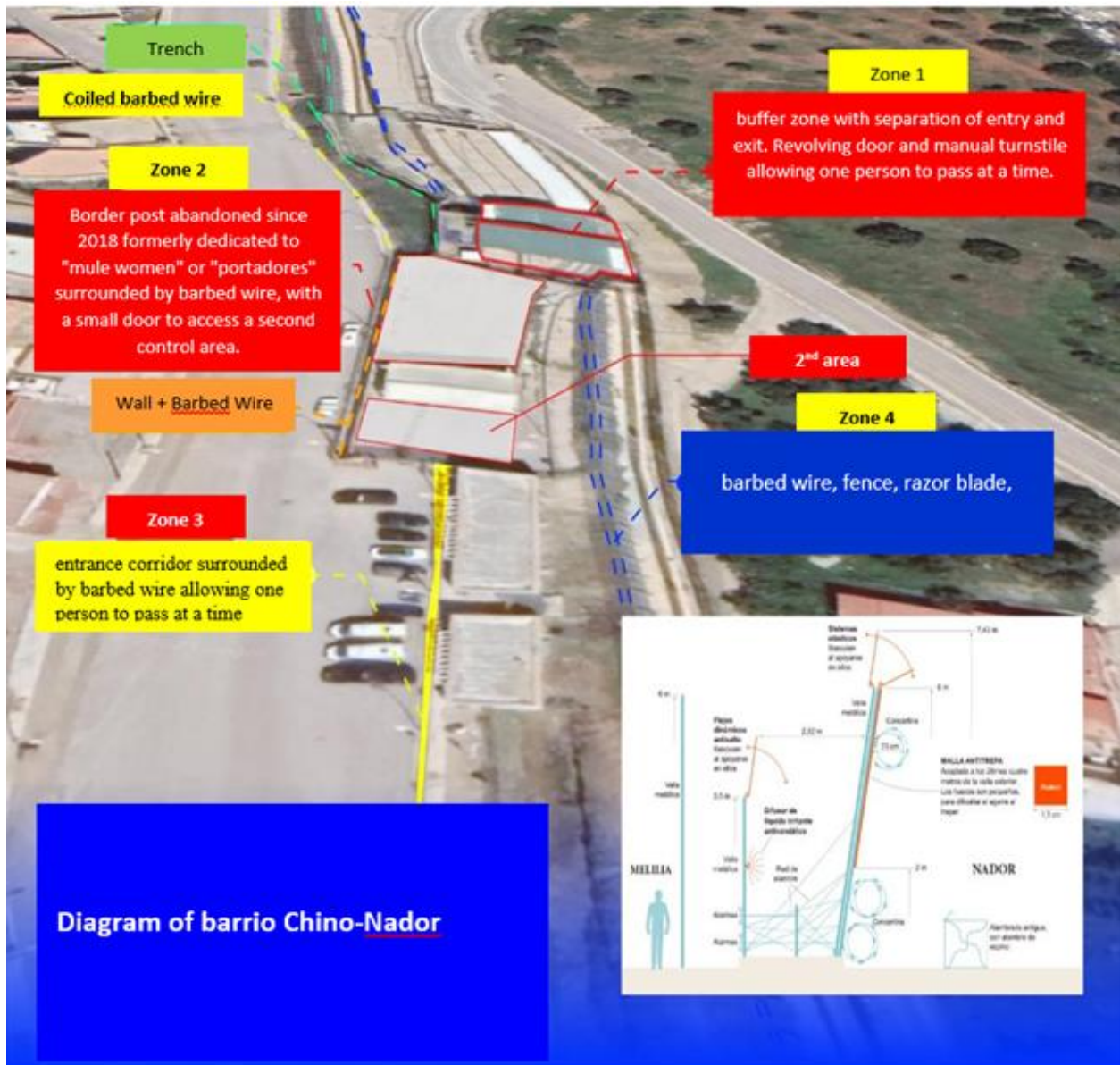
Figure 1: The four zones of the “Barrio Chino” border crossing + characteristics of the Melilla iron fence

During its visit to the crossing, the Fact-finding Commission inspected the collapsed part of the fence that tops the wall surrounding the crossing yard. It also examined the remains of clothes, wooden sticks and backpacks stuck to the barbed wire on top of the doors and on the fence (Picture 6).